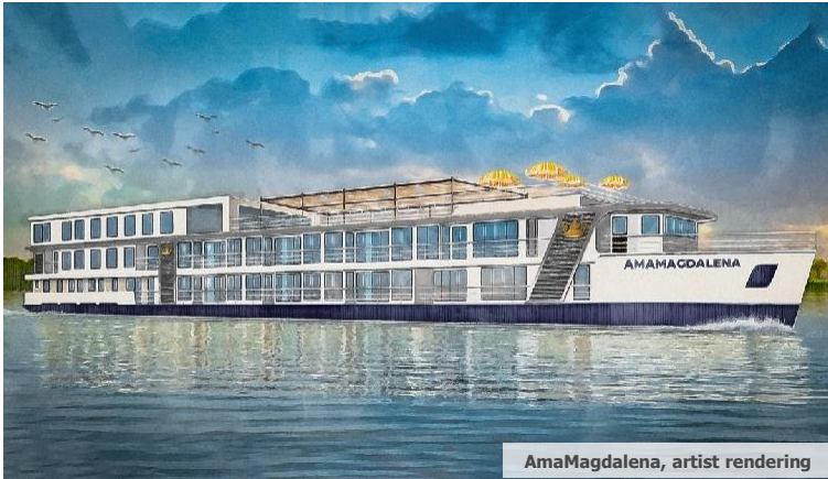
AmaMagdalena, artist rendering

7-night river cruise | November 22-29, 2024