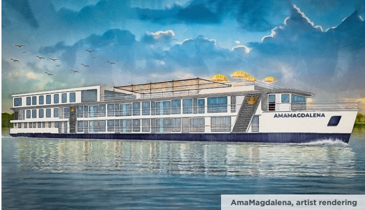
AmaMagdalena, artist rendering

7-night river cruise | December 7-14, 2024 | aboard AmaMagdalena